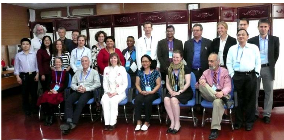
Members of the ProGRESS consortium

The ProGRESS project represents a welcome opportunity: a new collaboration in a very important research area. China's economy is transforming and will rely more and more on innovation. Along with this comes the necessity to address issues such as social conflict. The question is: How can innovation be encouraged to tackle new social objectives and challenges?