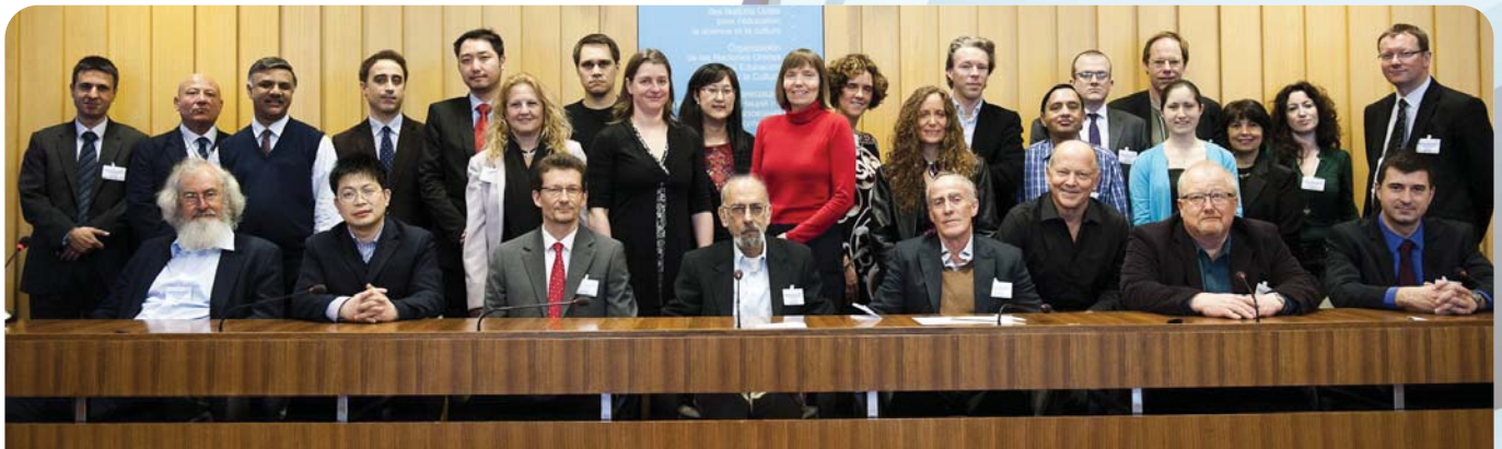
ProGReSS Members and Advisors at UNESCO-hosted Kick-off Meeting in Paris